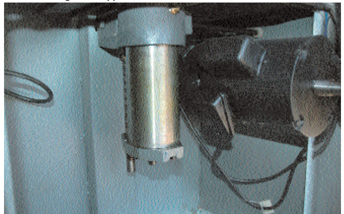
Massive lifting tube supports the tables

Specs An 1100 watt electrically braked induction motor drives the cutter via twin v-belts. Drive to the feed rollers is via chain drive; with a good size flywheel to give a more even feed. The feed rollers are turned on and off with a lever at the infeed end of the